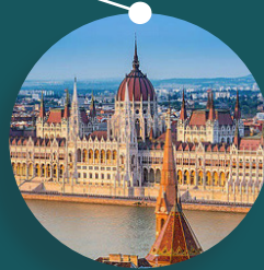
Semester 1 : Pázmány Péter Catholic University (Budapest, Hungary)