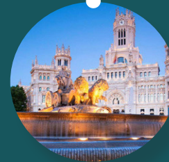
Semester 2 : Universidad Autónoma de Madrid (Spain)