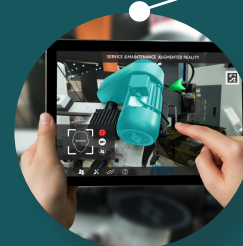
Semester 4 : Research or Industrial Internship (All over the world)

Are you interested in Sensors and Sensory Processing, Multi-Camera Systems and Deep Learning in Computer Vision? Would you like to become an expert in Image Processing, Video Analysis as well as Image Acquisition and Reconstruction? Are you for Automatic Video Monitoring, Biomedical Image Processing or Augmented and Virtual Reality?